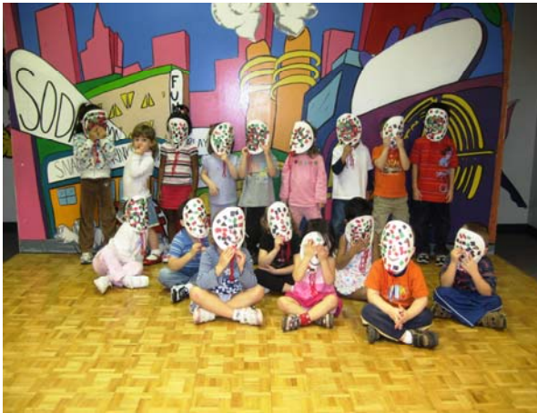
Pre-Pr I: Showing off their beautiful masks!!

New Year started with the celebration of African American culture "Kwanzaa". Children had group discussions on depicting the wild life of Africa. Children also had the opportunity to learn and do the rain dance wearing their own creative African masks!!