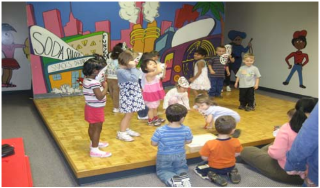
Pre-Pr I: Getting ready to put on the Kwanzaa Masks!

Our primary classes have made some great African masks from the gallon milk jar and Kwanzaa Masks from paper plates!!