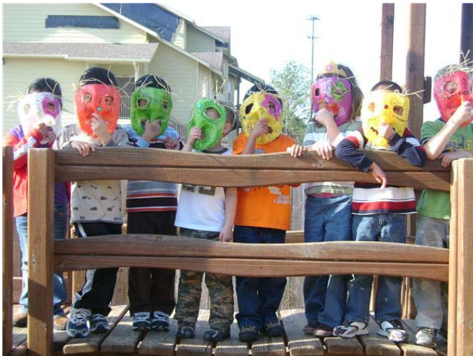
Pre-Pr II: Can you guess who is who!

Toddlers have been learning all about weather, five senses, and about Martin Luther King's birthday. You will also see that teachers will be enhancing children's vocabulary by introducing sensorial lessons through feeling, touching, seeing, hearing, and tasting. Parents can also do some senses activities at home with children. Going out for walk and talking about flowers; feeling the texture and then smelling, and spending great quality time with the children.